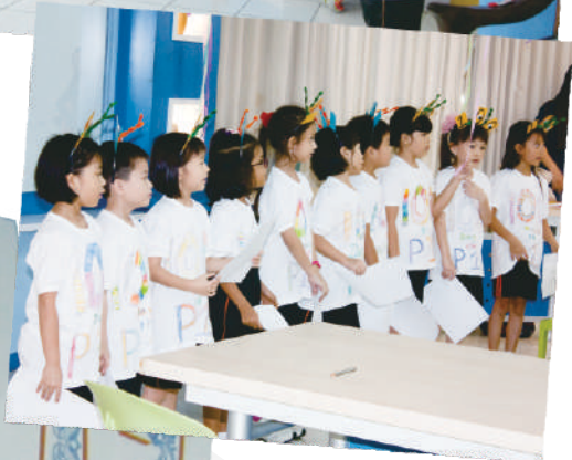
Students preparing for a problem solving activity