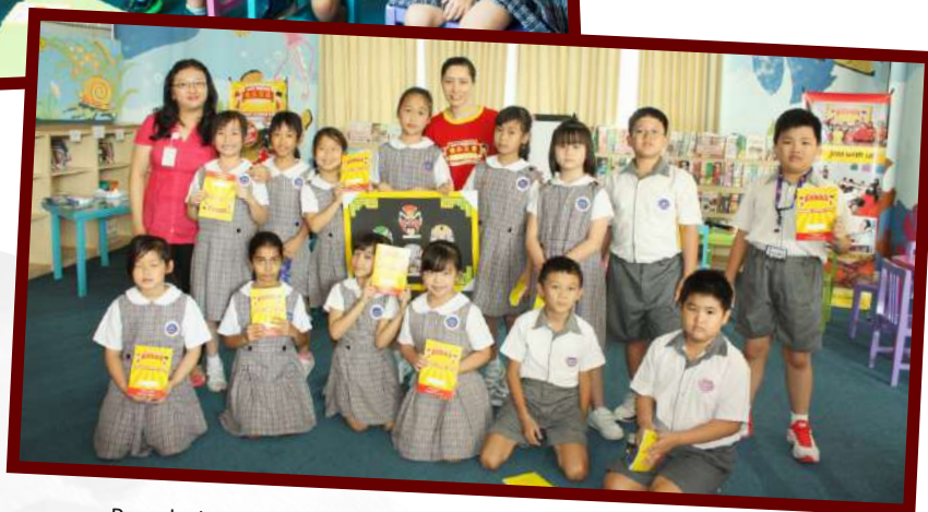
Proud winners of the reading rewards