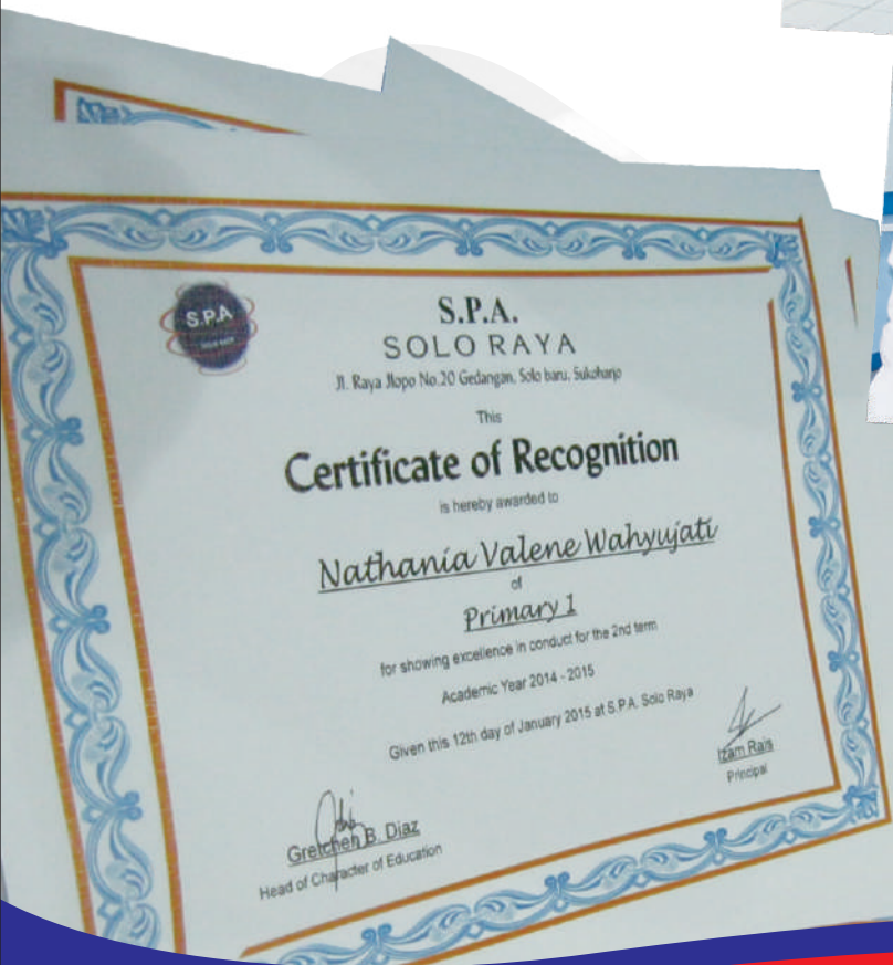
Certificate of recognition for good conduct