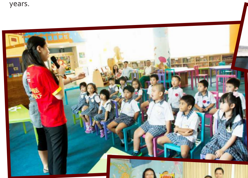
Playing games in the library

This is a programme designed to strengthen the Chinese language proficiency of our students. They are required to read a Chinese book every term and answer related questions to show their understanding. Prizes are then given to the top winners. This initiative also helps develop healthy reading habits from young, and enable the S.P.A. student to be fluent in the language within a few years.