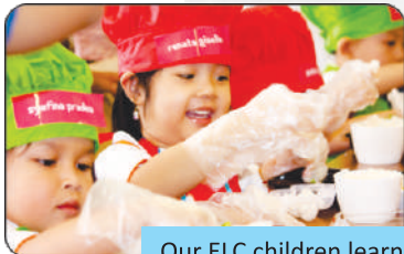
Our ELC children learning how to cook in a Korean restaurant