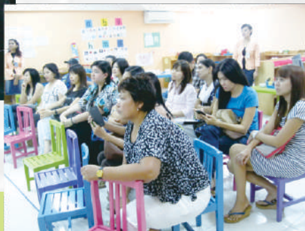
Parents participating in a Math workshop