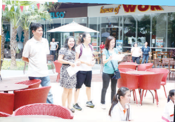
Parents assisting in an outdoor competition