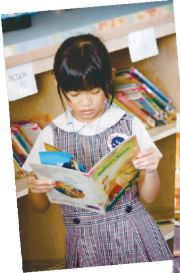
Analytical skills in reading are tested by our teachers

A keen reading habit is highly encouraged. Awards for the best book reviews are given every term to the most deserving students. These reviews consist of questions which support critical thinking and hence, stimulate the child's intelligence.