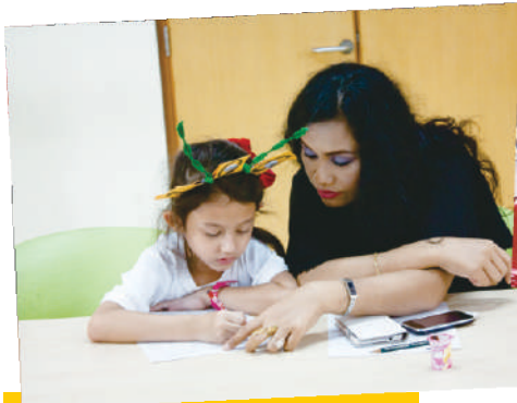
An activity in one of the Primary 1 workshops