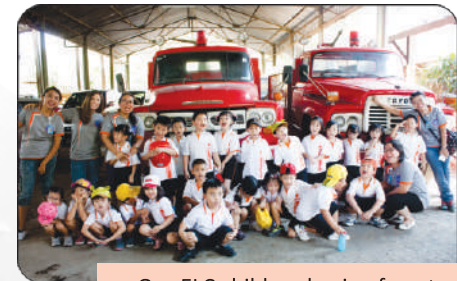
Our ELC children having fun at the fire station