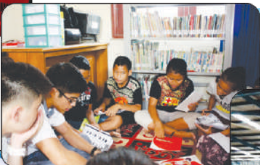
Students teaching English and learning about life in the villages