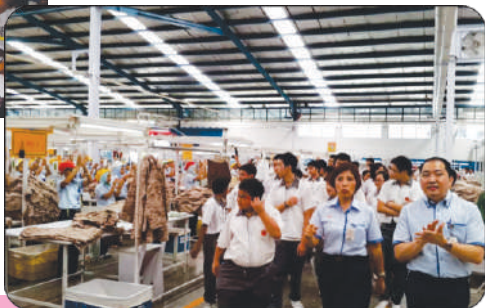
A visit to PT Sritex to learn firsthand about world class manufacturing operations