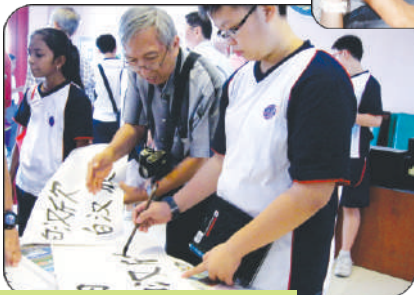
A visit to HAKKA assosiation