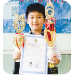
Olimpiade Sains Nasional

Already ongoing or if not, in the near future: