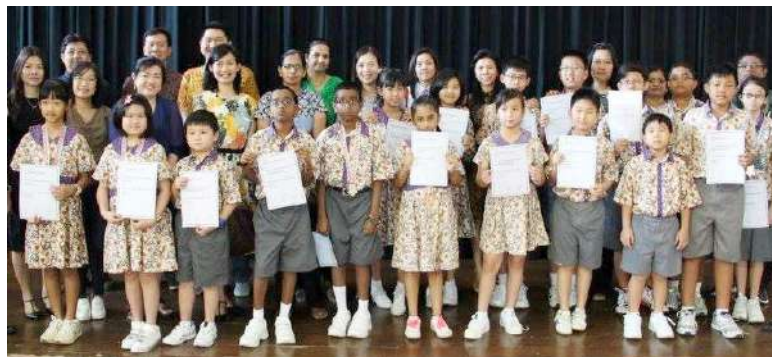
INTERNATIONAL SINGAPORE MATHS COMPETITION