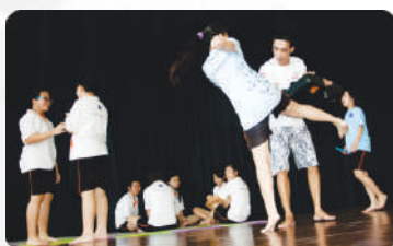
Mixed Martial Arts