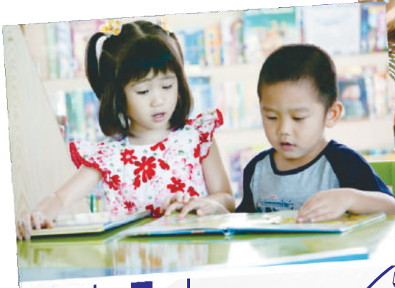
Cooperative learning via reading together