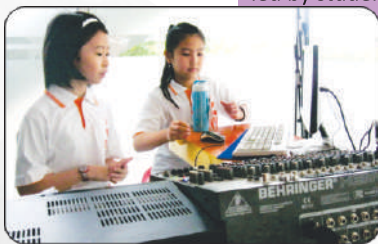
Our weekly radio broadcast in English and Chinese, led by students to sharpen their speaking and language ability