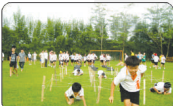
Our leadership camp to encourage the development of a student's leadership potential