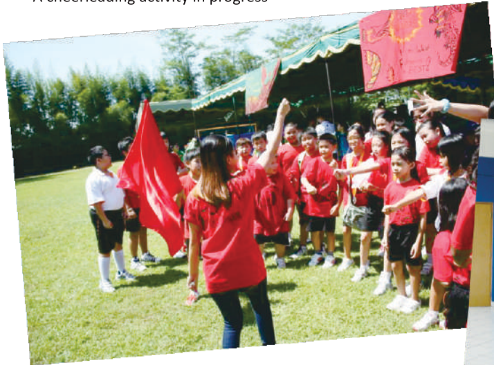
A cheerleading activity in progress