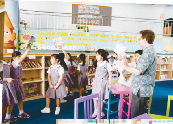
A reading activity in the library