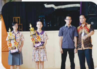
The Sound of Music East Java