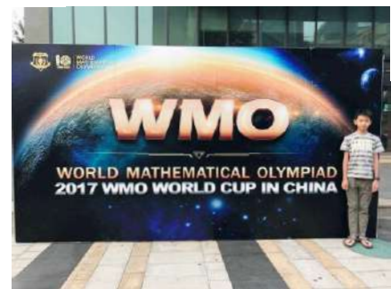
WORLD MATHEMATICAL OLYMPIAD