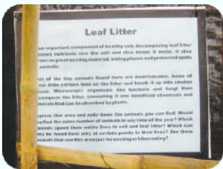
Leaf Litter Station