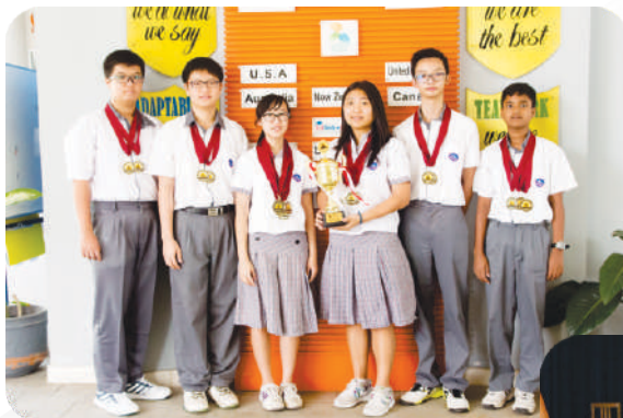
World Scholar's Cup