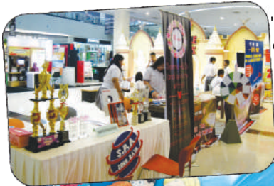
'Battle of the Brains' – A competition which allows our senior students to gain real world business experience

At the class level, from the Early Learning Centre, through Primary and right up to Secondary, our children are empowered with positions of responsibilities. Examples include students being the class captain, president, vice president or treasurer.