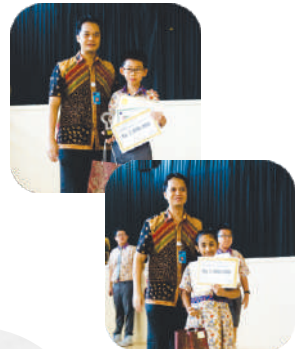
A+ Mathematics Surabaya