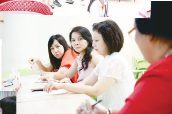
Parents preparing for an activity with their children