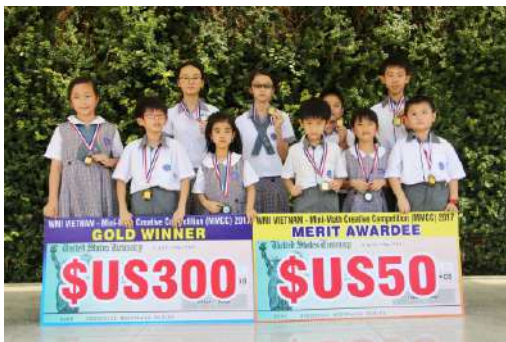
WORLD MATHEMATICS INVITATIONAL