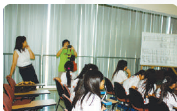
Music / Choir