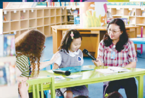
A reading session in the library