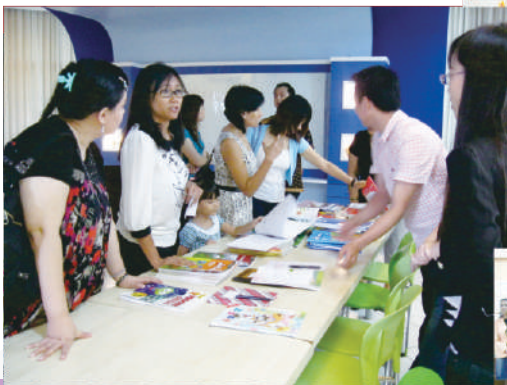
Educating the parents on the pathway into Primary education